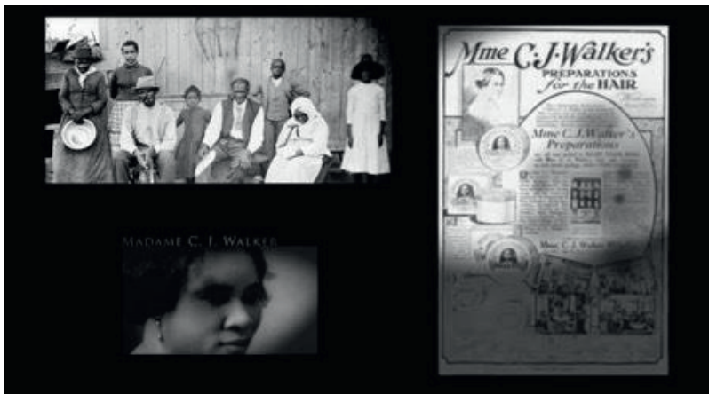
Ilustración 5: © Sánchez Salcedo (2013: 06:07; 07:40; 07:49)

El segundo rótulo: “Historia del pelo afro. Desde la esclavitud hasta hoy” da paso a una parte del documental dominado por Sofía. Esta hace un resumen de los diferentes acontecimientos que han ido influenciando la estética capilar de los afro-descendientes a lo largo de la historia, – desde la esclavitud y sus consecuencias hasta el día de hoy– mientras se intercalan y apilan fotos de época.