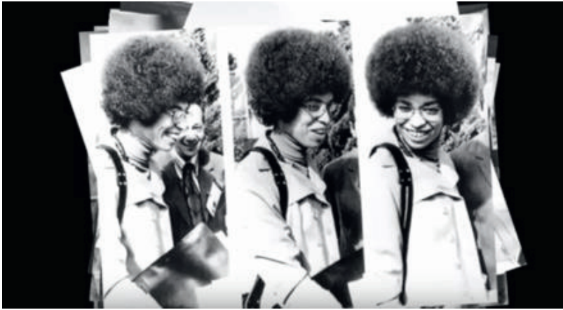
Ilustración 6: © Sánchez Salcedo (2013: 10:20)

La entrevistada explica los orígenes y los motivos de la práctica de desrizarse el pelo entre africanos/as y afro-descendientes argumentando que muchas personas esclavizadas se ocupaban de la higiene del pelo de sus amos/as. El estatus social y la buena calidad de vida que tenían los/as amos/as y la percepción negativa que tenía este grupo dominante de los rasgos de los/as esclavos/as, “propios de la raza negra” (07:35), llevaron a que se vieran obligados a emular la estética dominante y a querer ocultar su pelo con sombreros y fulares. Sin embargo, comenta, no fue hasta alrededor del 1800 cuando Madame C.L. Walker introdujo “la primera línea de productos exclusivos para la mujer negra” (07:40). En ese periodo Garret Morgan desarrolló y comercializó el primer desrizante capilar por casualidad, cuando, al tratar de buscar la solución para suavizar el tejido de sus telas para evitar pérdidas económicas por la rotura de agujas, se dio cuenta de que el producto que había desarrollado también podía aplicárselo a su pelo. Tras este hito, la narradora Sofía hace una gran elipsis y retoma la historia del pelo afro en los años sesenta del siglo veinte. Así establece al movimiento estadounidense Black Power como el origen de la lucha por concienciar a los afro-descendientes de que deben estar orgullosos de sus raíces africanas, de que: “Tú eres negro y tu belleza es negra” (10:44).