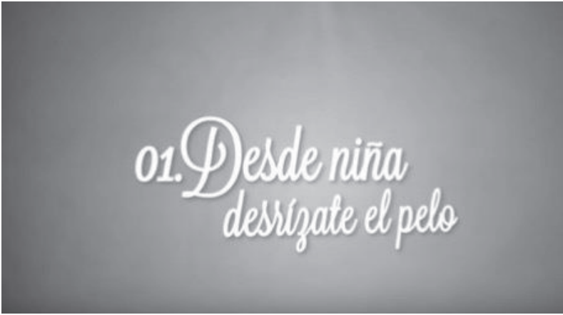
Ilustración 3: © Sánchez Salcedo (2013: 01:58)