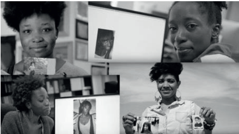
Ilustración 4: © Sánchez Salcedo (2013: 02:14; 02:45; 03:54; 03:05)

Las respuestas de las protagonistas se escuchan en un intercalado entre las imágenes sincronizadas de la entrevista e imágenes congeladas de las cuatro sosteniendo una foto de ellas de niñas o de adolescentes. Las entrevistadas relatan los recuerdos de su pelo en este periodo de su vida: todas afirman que llevaban peinados típicamente afro, como los “afros” propiamente dichos en el caso de Gaele, trenzas, coletas y moñitos en