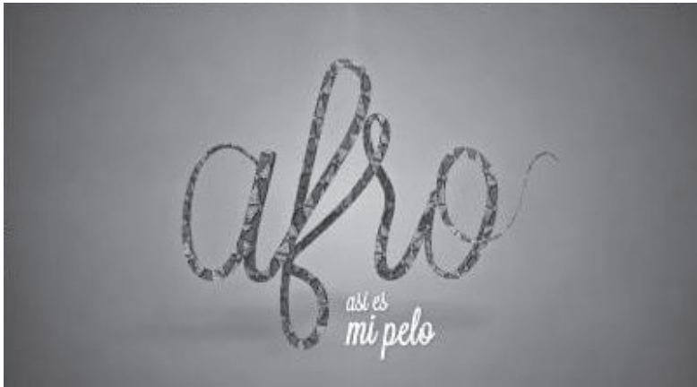
Ilustración 1: © Sánchez Salcedo (2013: 00:44)

su presencia en los medios audiovisuales generalistas delante o detrás de la cámara es muy escasa (cf. Green 2012: 512; García Barranco 2011: 5) 7 .