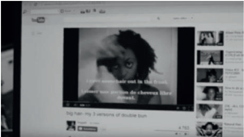
Ilustración 8: © Sánchez Salcedo (2013: 19:40)

Las entrevistas se intercalan con tomas metatextuales de vídeos de YouTube y no debe pasar desapercibido que, aunque la entrevistada no lo comente, los vídeos que está mirando son mayoritariamente anglófonos, excepto uno, que es francófono. La preminencia de las fuentes anglófonas en las que se basan Gaelle y Sofía, junto con la genealogía “afro-estadounidense” de la historia del pelo natural que proponía la