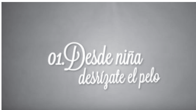
Ilustración 3: © Sánchez Salcedo (2013: 01:58)