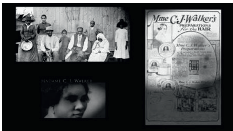
Ilustración 5: © Sánchez Salcedo (2013: 06:07; 07:40; 07:49)

El segundo rótulo: “Historia del pelo afro. Desde la esclavitud hasta hoy” da paso a una parte del documental dominado por Sofía. Esta hace un resumen de los diferentes acontecimientos que han ido influenciando la estética capilar de los afro-descendientes a lo largo de la historia, – desde la esclavitud y sus consecuencias hasta el día de hoy– mientras se intercalan y apilan fotos de época.