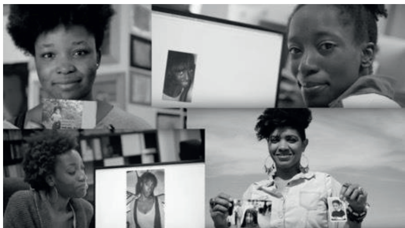
Ilustración 4: © Sánchez Salcedo (2013: 02:14; 02:45; 03:54; 03:05)

Las respuestas de las protagonistas se escuchan en un intercalado entre las imágenes sincronizadas de la entrevista e imágenes congeladas de las cuatro sosteniendo una foto de ellas de niñas o de adolescentes. Las entrevistadas relatan los recuerdos de su pelo en este periodo de su vida: todas afirman que llevaban peinados típicamente afro, como los “afros” propiamente dichos en el caso de Gaele, trenzas, coletas y moñitos en