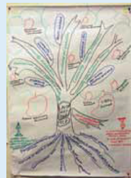
Thushan Kapurusinghe's 'results tree' portrays many complex ideas at a glance. (UNV)

Effectively, the ‘tree’ distils a four-page report into one simple and easy-to-absorb image.