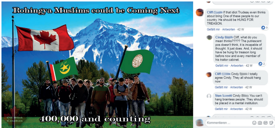
Figure 7. Meme and commentary are illustrating a spiral of escalation on the page OldStockCanadian .

and Matamoros-Fernandez (2016), which suggested that discrimination on Facebook pages of extreme right political parties is merely implied and “then taken up by their followers who use overt hate speech in the comment space” (p. 1167). It is thus again the analytical look on the discursive ensemble of the posts and comments in combination that helps understand the intentions, the dominant reading in the group and the implications of satirical content beyond the actual post.