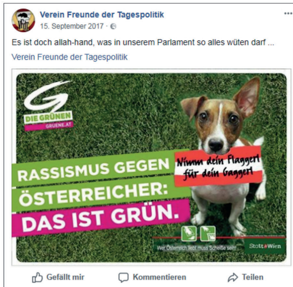
Figure 1. Satirical election poster ascribed to the Green Party and shared by the Austrian page Verein Freunde der Tagespolitik on September 15, 2017. The poster text translates to "Racism against Austrians: This is Green." The description text written by Verein Freunde der Tagespolitik uses a pun with the word "Allah" and translates to "That's the last straw, what is allowed to rampage in our parliament."

crimination against minorities. Within the pages' and groups' satirical and serious posts, we identified the use of populist strategies including the ostracization of others , attacks against the elites , and advocacy for the people (Engesser et al., 2016). Pages and groups turned against the political establishment in satirical form. In the case of one post published by the Austrian page (see Figure 1), a campaign slogan of the Austrian Green Party (This is green) is mimicked to equal Green politics to racism against Austrian natives. This satirical poster seizes the narrative of the elites who would neglect their people ( us ) and only serve the interests of foreigners ( them ). The meme is combined with a posted message in which a pun referring to "Allah" establishes a link between the unnamed them and Muslim immigration. Also posts, which derogated minorities and some of society's most marginalized groups (e.g., homosexuals, transgender, migrants; see Figure 2), were typical contents across all pages and the group in the material.