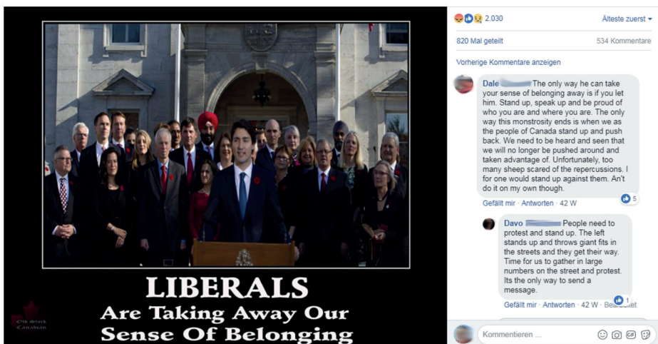
Figure 3. Meme and corresponding comments posted on the Canadian page OldStockCanadian .

Furthermore, a clear narrative of self-victimization was purported in the form that extreme right supporters are staged as oppressed minorities and victims of the new “liberal” ideas and values, which would ultimately rob them of their (national) identities (Figure 3). In sum, it becomes evident from the analysis of the original posts that creators and administrators of satirical Facebook pages and groups use them for promoting extreme right narratives, stencils, and images (see Wagner & Schwarzenegger, 2018, for a more detailed description of the analysis). As described above, after the initial analysis of contents shared by the pages/group we then analyzed the combination of post and comments and how these were related and played together, supported or questioned another and how this may contribute to the discursive strategy of mainstreaming.