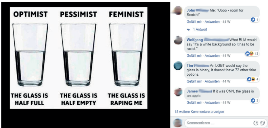
Figure 5. Meme and respective commentary posted on the page Laughing at Stupid Things Liberals Say illustrating how users follow and further the logic of the joke made in the post.