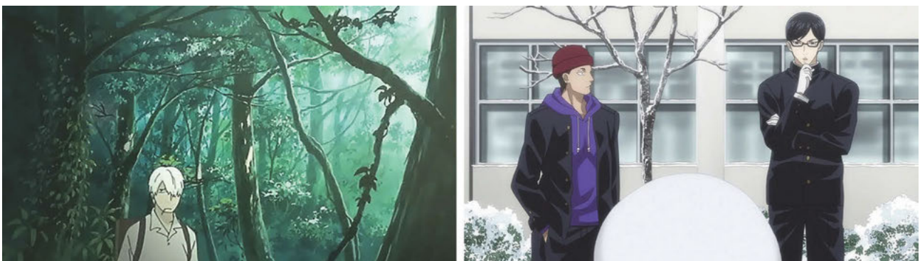
Figure 1. Screenshots of Mushi-shi (2005) and Haven't you heard? I'm Sakamoto (2016), from left to right.

Poitras (2001) dedicates a chapter to anime genres, discussing several genres and subgenres. The genre/subgenre ordering of the chapter suggests a hierarchical organiza-