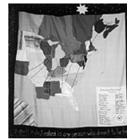
Escape – Ontario, Canada (Amherstburg Public School 1998)