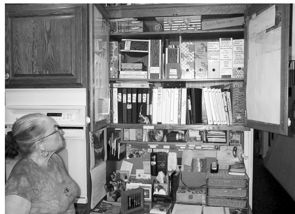
Figure 4. This hobbyist cooks explains how she places favorite recipes into files and folders in the kitchen cupboard. The recipes are parsed from a collection of more than 1,000 cookbooks.

details were elicited through probes, such as: what is this? how is this used? is this organized in some way? During the tour, photographs were taken; some were shot close-up, to capture the titles of books or file tabs with subject headings. The interviews and tours were audio taped and transcribed.