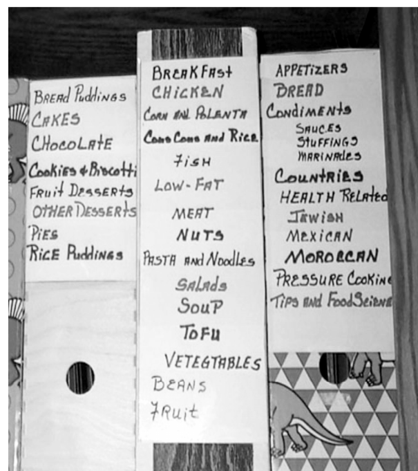
Figure 5. A closer look at the classification system.

The twelve household tours generated a data set of 70 single spaced pages of narrative and 125 photographs (see Figures 4 and 5). These materials shed light on the substantive content of hobby cooking;