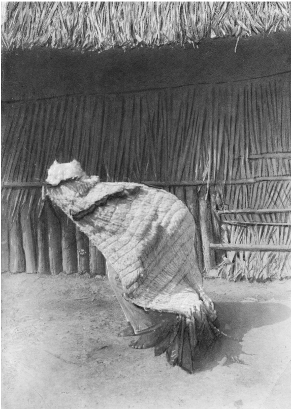
Fig. 4: Performance of the Ghost Dance at Boca do Baú, Curuá River (Nimuendajú 1919–20).

promised me that he would do it and so the dance could be resumed on September 18 (Nimuendajú 1921–22: 376).