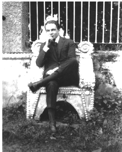
Fig. 1: Nimuendajú about 1913 in the park of the National Museum in Rio de Janeiro

Examining all the works published by Nimuendajú and the secondary literature about his life and work, it becomes evident that the ethnology of indigenous peoples represents a kind of parenthesis for his scientific work. This topic prevailed since his first publication, the famous monograph about the Apapokúva-Guaraní (Nimuendajú 1914), until his last fieldwork among the Ticuna, in 1945. However, Nimuendajú also published 18 articles about indigenous languages, which generally present vocabularies or morphological descriptions according to grammatical conventions of his time, but also contain some comparisons and hypotheses about the genetic relationship of the languages recorded by him. Moreover, he became well known as a collector of archaeological and ethnographic objects for Brazilian and European museums and also for his frequently uncompromising defense of indigenous people’s rights to their lands and cultures or even to their mere physical survival. This is illustrated in several articles and reports regarding indigenist politics, as well as by many private letters addressed to colleagues and friends in different countries.