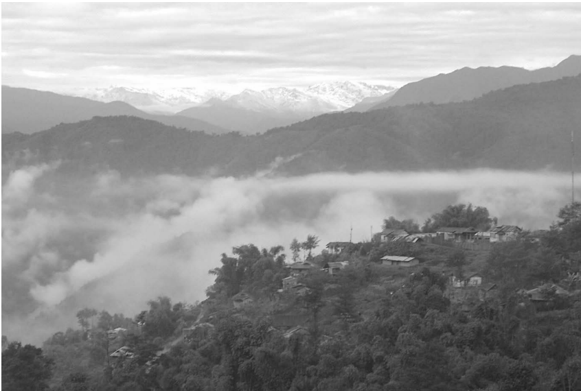
Fig. 1: Chayangtajo (05.12.2011,).

with China (Tibet) merely 50 kilometres away. Today, much has changed. A road, 81 kilometres in length, connects Chayangtajo with the larger town of Seppa. Governmental development projects, education, and Christianity have left their marks on the town.