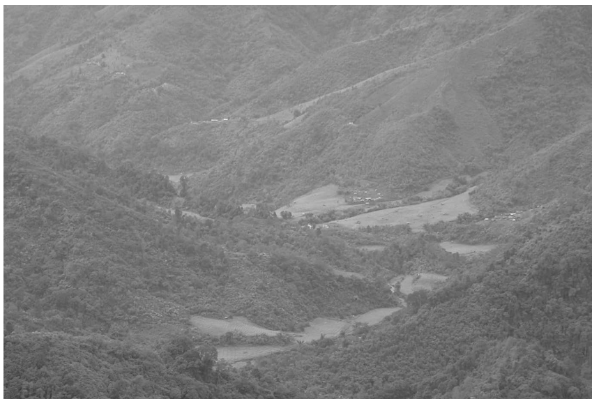
Fig. 3: Looking down on the Para River and the two parts of Killo Village (05.12.2011,).