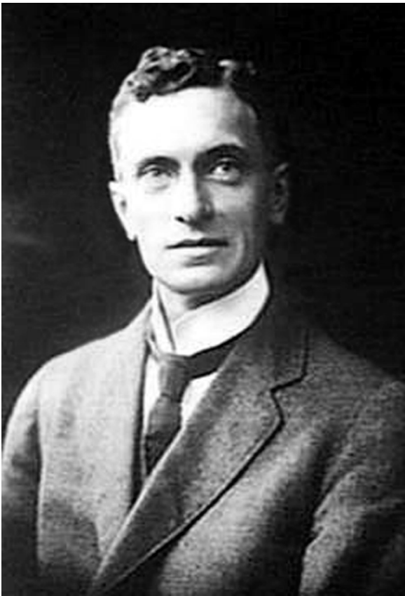
Fig. 1: Herbert Basedow, pioneer of Australian rock art research.

While it is not possible to conclusively exclude the possibility that Pleistocene Australians depicted extinct fauna, the likelihood of this is remote, primarily because we lack any convincing evidence that figurative depiction was used at the time most megafauna still existed. The only extinct Australian animal species whose identification in rock art can reasonably be accepted, at least in a number of clear enough cases, is the Thylacine . Its imagery has been reported from the Pilbara and Arnhem Land. 1 Basedow's initial observations concerning geological processes postdating petroglyphs at specific sites are perhaps more pertinent.