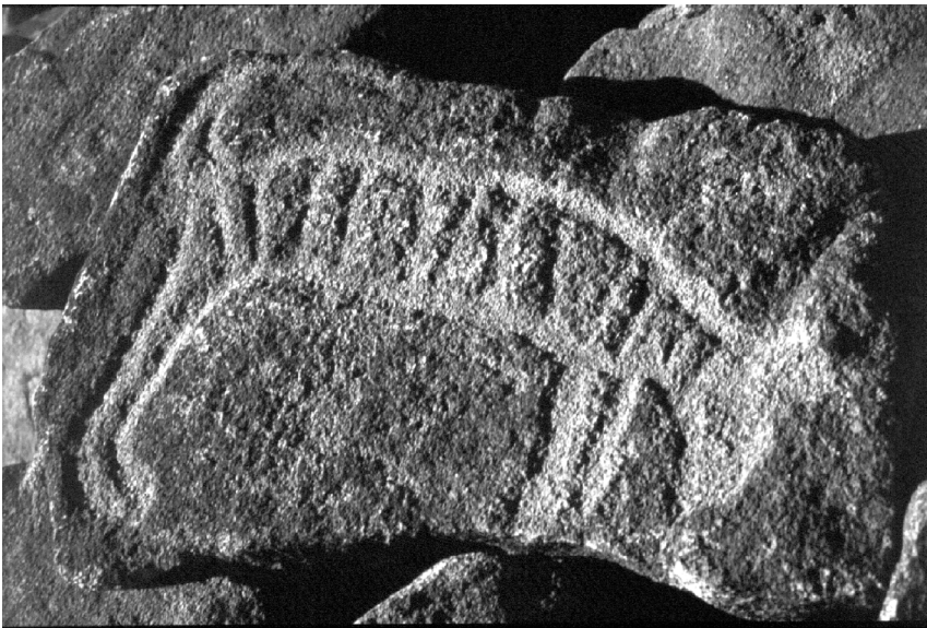
Fig. 2: Presumed depiction of a thylacine, Murujuga, Dampier Archipelago, Western Australia.

pation of the site began 185 ka B.P. These spectacular numbers exceed the accepted duration of Australia's colonization, but they were the result of a misuse of the dating method (Gibbons 1997; Roberts et al. 1998, 1999).