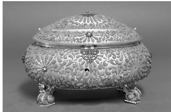
Fig. 2: Jewel box, 16th–17th century; gilded copper and coral beads (© Galleria Regionale della Sicilia, Palermo).

in the broader, European and, indeed, global context, as the roots of “local” events are frequently to be found “worlds” and centuries away. To discover these roots, one should even go deep into the “mythological” past, which the subtitle of the exhibition, “from Odysseus to Garibaldi,” unmistakably suggests. The exhibition captures these mechanisms at work in the specific case of Sicily – a component of the modern Italian nation-state but at the same time also “the key to understand Italy,” as stated Christoph Vitali, the Director of the Bundeskunsthalle, at the opening ceremony – because of its clear-cut identity that draws on and contributes to the rich, pan-European, plurality. – (“Sizilien. Von Odysseus bis Garibaldi.” Kunst- und Ausstellungshalle der Bundesrepublik Deutschland, Bonn, Germany, 25 of January – 25 of May, 2008. Curators: Giulio Macchi and Prof. Dr. Wolf-Dieter Heilmeyer. Director of the Project: Katharina Chrubasik.)