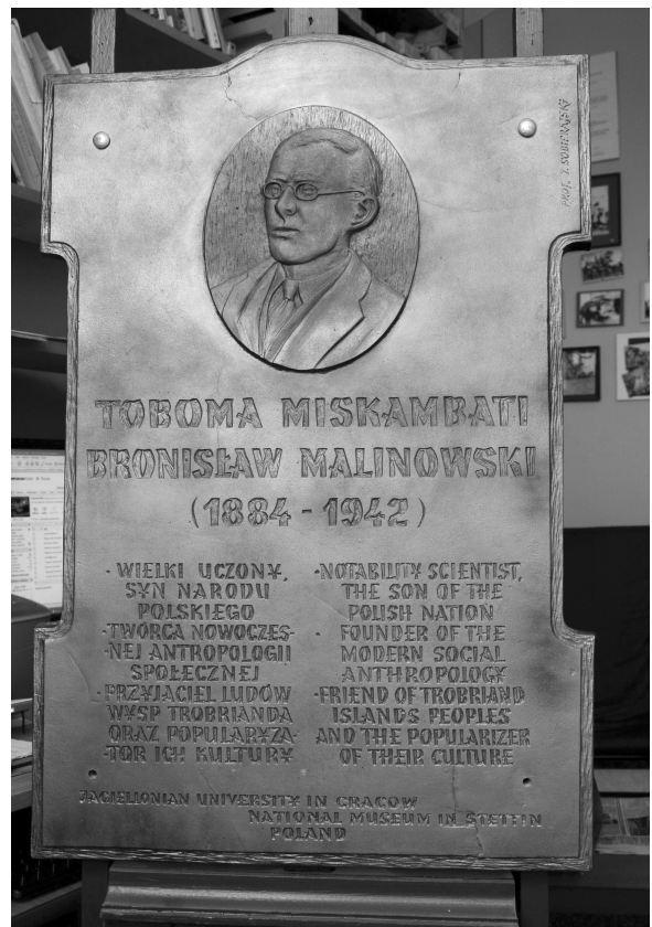
Fig. 1: The memorial plaque dedicated to Bronisław Malinowski in the Trobriand Islands.

In this manner, after nearly a century, Poles have finally paid appropriate tribute to the famous pioneer of anthropological fieldwork and one of the fathers of functionalism. It needs to be stressed, however, that in communist times Malinowski and his anthropological theory did not enjoy the same recognition and popularity in his native country as they did in the Western world. During the Soviet period, social sciences in Poland were dominated by Marxist ideology and viewed Malinowski’s functionalism as “a purely bourgeois construct,”