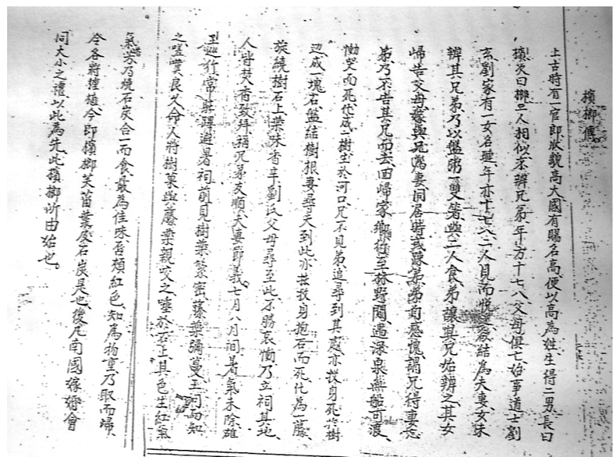
Fig. 13: Facsimile of the entire “Story of the Areca Palm Tree” in Linh Nam chích quái liệt truyện (handwritten version, 1695,).

roll (such as “Why Do We Use a Tip-Cut-Off Betel Leaf?”). Nine other tale variants have details and/or episodes concerning the areca tree, betel vine, betel quid, and betel quid remains. With regard to languages, four tales, among them the oldest one, are directly translated from chữ Nho , 5 others from French (10), and Vietnamese (16). Only three versions are originally quoted in English.