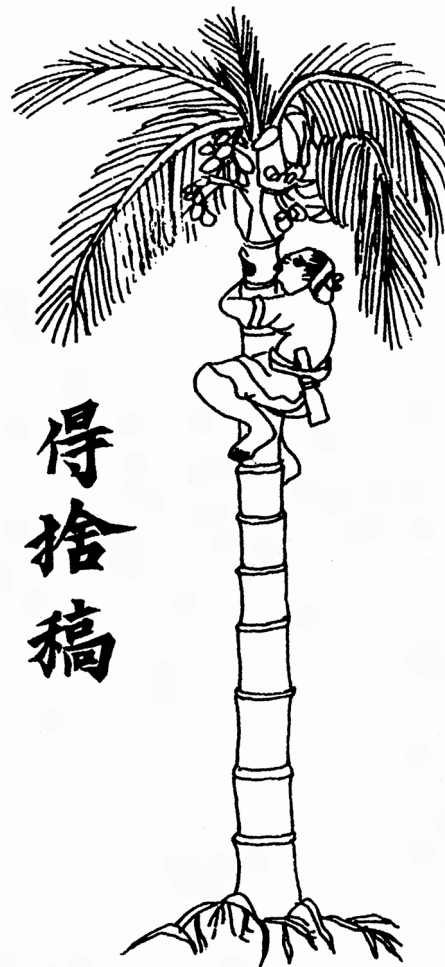
Fig. 7: Plucking areca nuts; Saigon suburbs; early 20th century; traditional woodcutting.

We can see the popularity of areca trees in the toponyms with cau or tân lang (areca) and trầu (betel) terms. The oldest one is seemingly the làng Cau (Areca village), Bắc Ninh Province. Archaeological artifacts from this area prove that the locality was inhabited by the Việt from the begin-