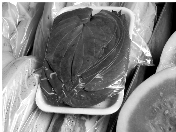
Fig. 17: Betel leaves in Paris 13è, France.

After the end of the war (April 30th, 1975), over three million Vietnamese left their country and