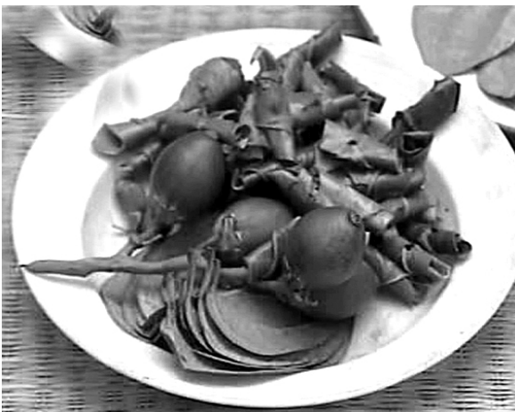
Fig. 11: A betel dish in North Vietnamese countryside (, Bắc Ninh, 2003).