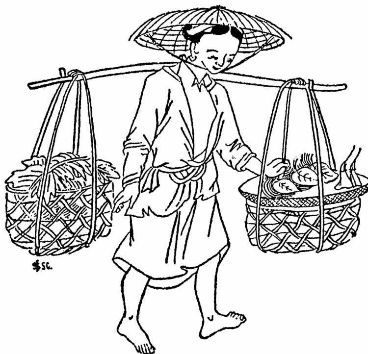
Fig. 14: Street vendor of betel in North Vietnam; in the 1930s.

derly female population is rather low, too (personal observation, 2002–2004).