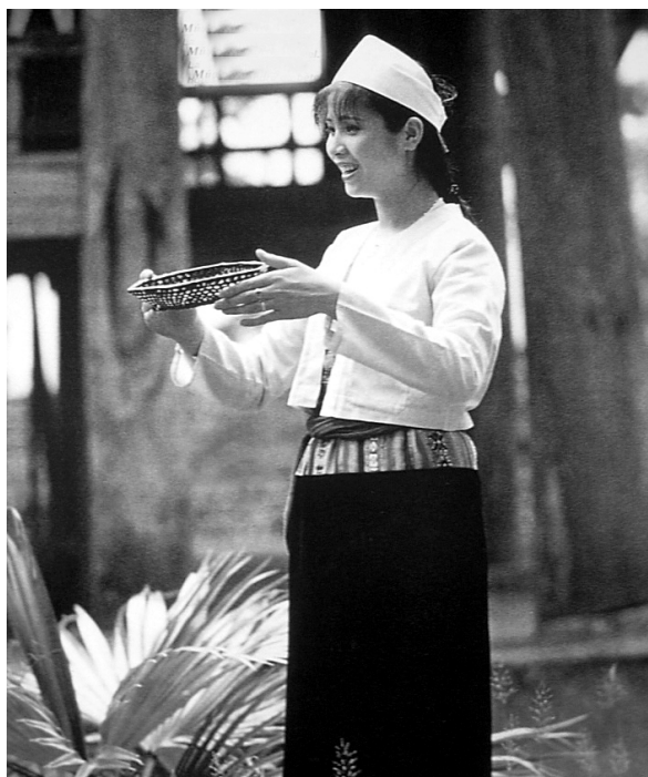
Fig. 18: A Mường lady (courtesy of Dr. Trần Tiến, Hòa Bình, 1999).