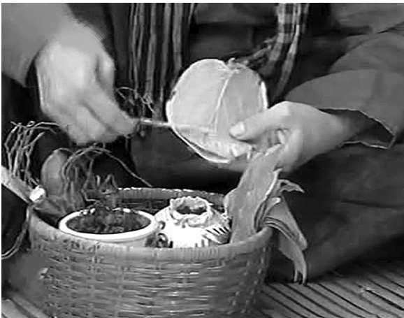
Fig. 10: A betel basket in Bạc Liêu; about 1940.