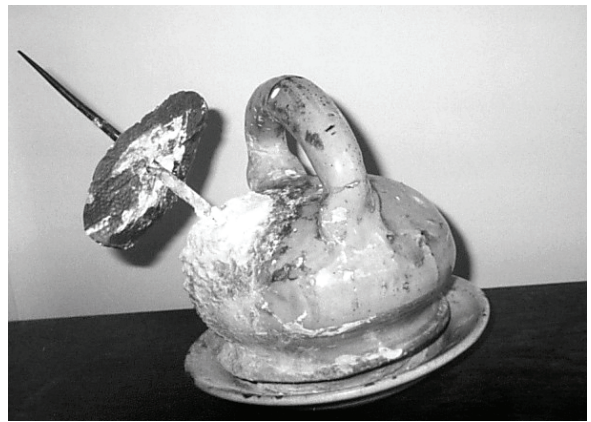
Fig. 9: Lime pot in ceramic; late 1950s, Hanoi (Nguyễn Xuân Hiến).

More generally, after a long service dried slaked lime would obstruct the spatula hole of the lime pot; it turns useless. People never break it out or destroy it. It must be placed with high veneration at the foot of secular banyan trees, in front of temples or shrines. About half a century ago, one could still see such banyan trees near shrines and temples in Hanoi with numerous old and useless