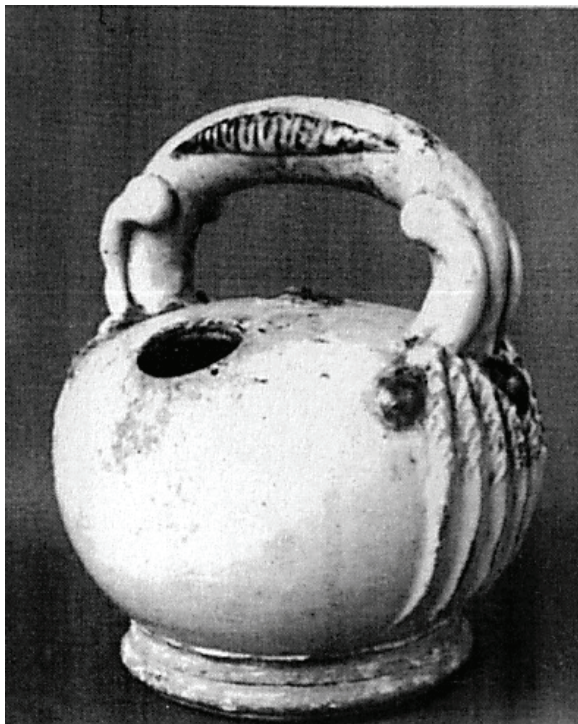
Fig. 8: Lime pot in ceramic; 17th century.

It was forbidden to break the dried lime layer on and around the spatula hole. The owner invited usually an old man to carefully saw off the layer. As numerous and as big these pieces were, as proud was the house owner. Or they waited until the lime aureole would fall down. The dried lime pieces from this layer were hung up in the house's back entrance or by-entrance that was used by women, especially by menstruating women. These persons were often haunted by devils; the dried lime layers turned the devils inoffensive when women entered the home.