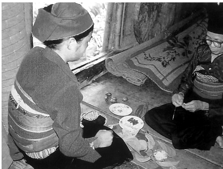
Fig. 2: The skill of preparing betel is transferred from generation to generation. The Mường.

If you who are a quan lang bring in betel leaves, then, please, come in.