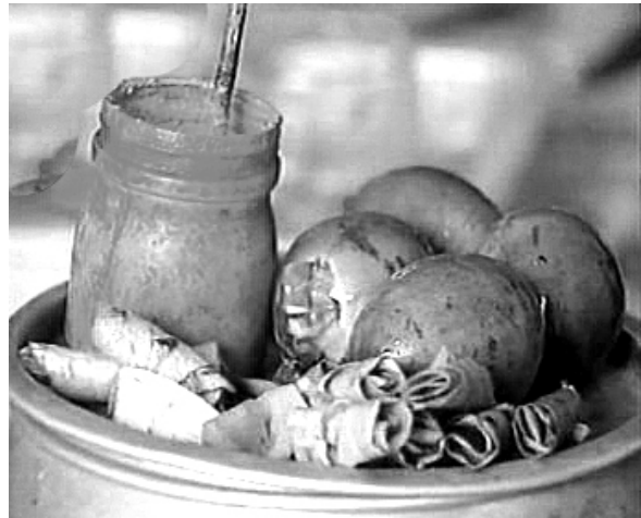
Fig. 12: A betel service in District 8, Saigon (Nguyễn Xuân Hiền, 2004).

The lime pots are always a curiosity for outsiders. From 1889 on, the French voluntary soldier Louis Bonnafont (1924: 10) has painted all that he was attracted by, e.g., the lime pot, the tortoise, etc. on the wall of a Buddhist pagoda on the seaside at Nam Ổ area, near the Hải Vân pass. Vietnamese ceramic lime pots, most of them are brand-new ones and without any vestiges of usage, are conserved in various museums abroad such as Musée de l'Homme (Paris), Musée National des Arts Asiatiques – Guimet (Paris), Musée des Arts Africains et Océaniens (Paris), Musée National du Guinée (Paris), Musées Royaux d'Art et d'Histoire (Brussels), etc. Many valuable lime pots are firsthand