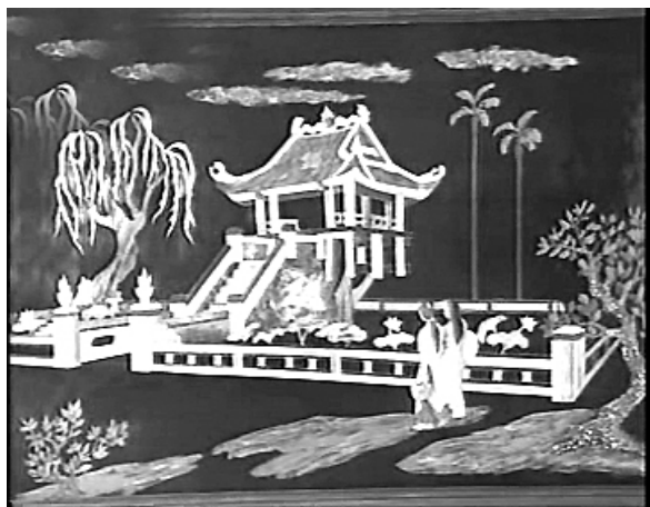
Fig. 19: Bamboo-inlays with areca palms at One-Pillar Pagoda (Nguyễn Xuân Hiến, Saigon, 2004).

can meet on the streets some old ladies who still chew betel. In a couple of Paris-based shops with “produits exotiques,” one can sometimes get fresh areca nuts and betel leaves (but never chay bark) from Vietnam. In the UK, the Vietnamese reside side by side with heavy betel addicts from India, Pakistan, or Bangladesh. They can easily get paan masala , but they complain “betel is not the betel we used to chew, the taste is really unacceptable.” The sensitive difference in taste discourages local