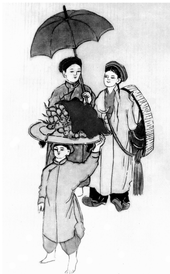
Fig. 5: The Lễ Đi Ăn Trầu (rite of visiting and betel-chewing); early 20th century; traditional woodcutting (courtesy National Museum of Arts, Saigon, 1975).

Ancestors, genii, etc. also accepted the betel quid as introducing a matter. In all religious and ritual ceremonies, in public or in private, the betel leaves and the areca nuts were a must. For a dead, an ancestor, or a deity, betel and areca – with a cup of fresh water (preferably rainwater collected